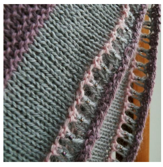
Option 2: lace edge with beads.