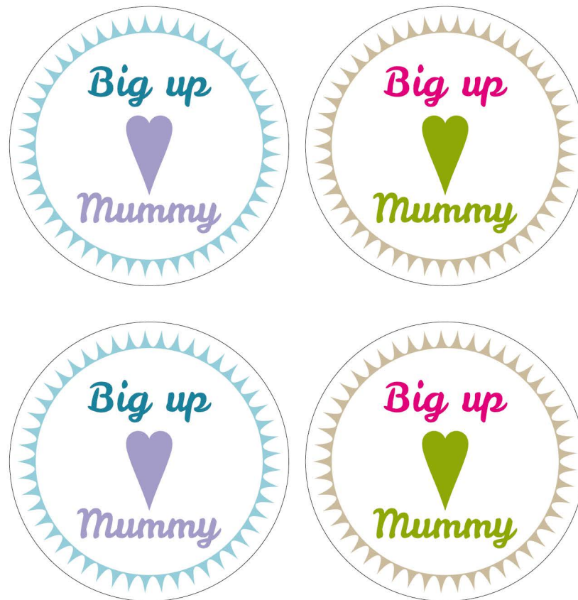
toppers (convient à une perforatrice de 50mm)